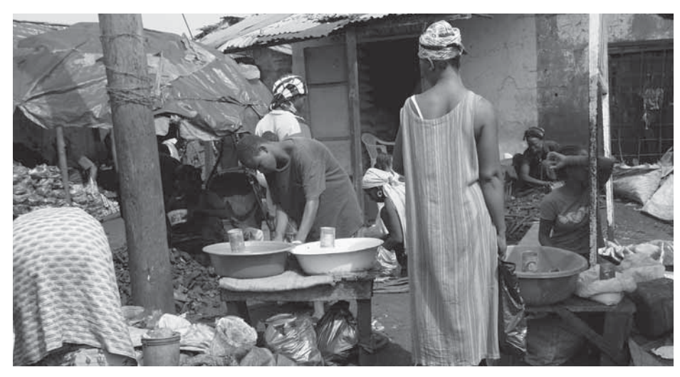
"One thing that we have learned over the years is that neither doom-and-gloom scenarios nor destructive criticism will inspire people and governments to act. What is needed is a positive vision, a clear road map for getting from here to there, and a clear responsibility assigned to each of the many actors in the system." — Former UN Secretary-General Kofi Annan 3

The urban poor are the designers, builders and suppliers of the majority of affordable housing in Africa's cities. Their self-help efforts have done what decades of government housing programmes, formal sector development projects, housing rights campaigns and international development interventions have failed to do: provide most of the urban poor with shelter and basic services – right now when they need it, not in the distant future.