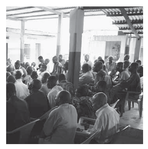
Community movements that were born in struggles against eviction have transformed themselves into proactive leaders in a process of finding solutions to housing problems in their cities.

ally erupts. For example, incremental slum upgrading will often provoke reaction and result in contestation between different interest groups in the community and in the wider urban context. It is therefore important that conflict resolution mechanisms are established and used.